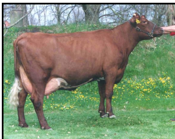
Netta, a daughter of Stensjo