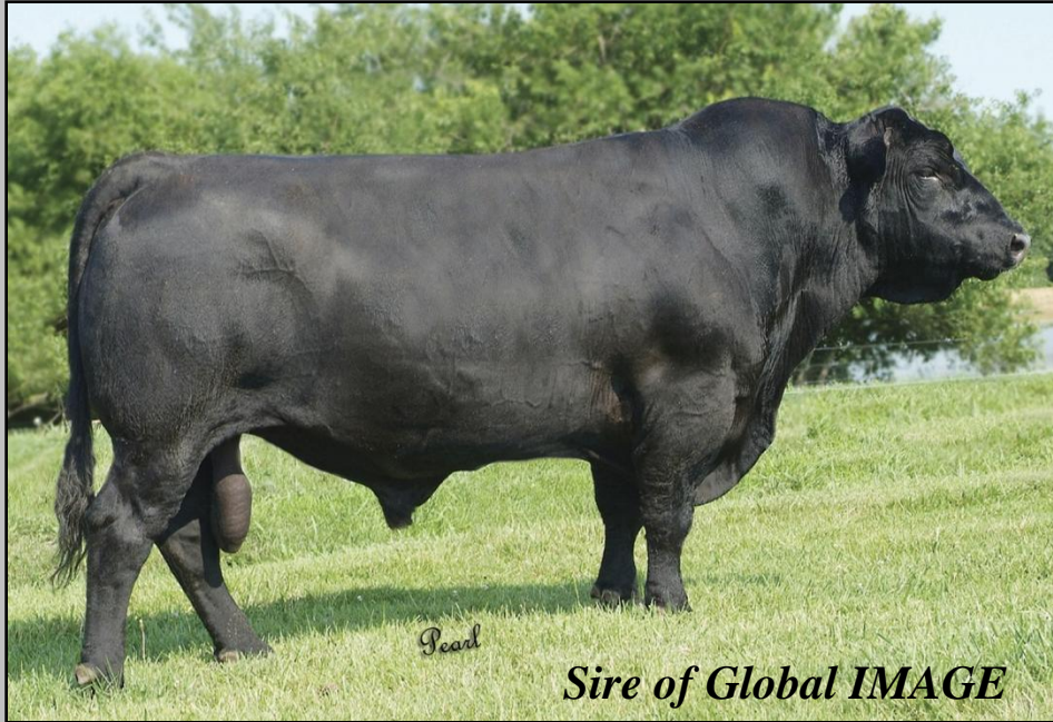
Sire of Global IMAGE