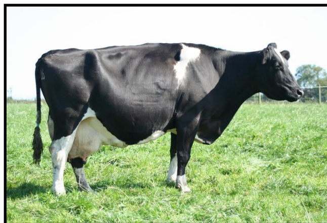
Deangate Queenie 9 (after giving 105 tonnes)

The first daughters of Deangate Tarquin are milking well, with high fat and protein percentages. They have impressive udders and good legs and feet. Deangate Queenie 9 th BFE94(6), the dam of Tarquin, has given 108 tonnes of milk so far and she looks fantastic milking in her 13 th lactation. The Queenies are a great cow family and Queenie 9 th is one of five maternal sisters that have done very well, with three classified EX or VG.