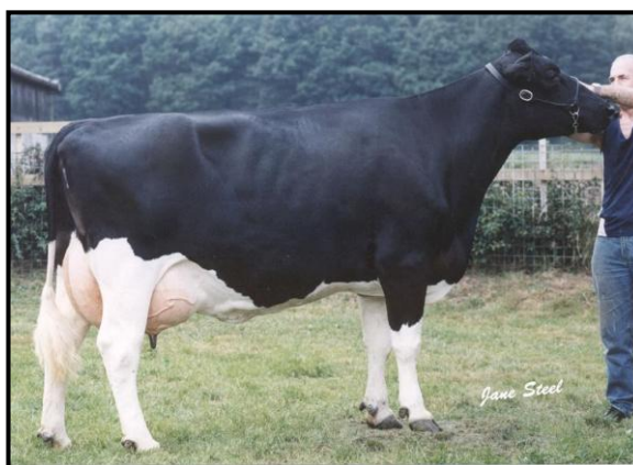
Deangate Queenie 14 BFE93(2), dam of Quadrant